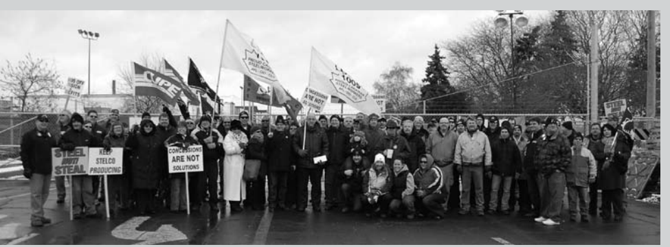
Hamilton CUPE members join the picket line.